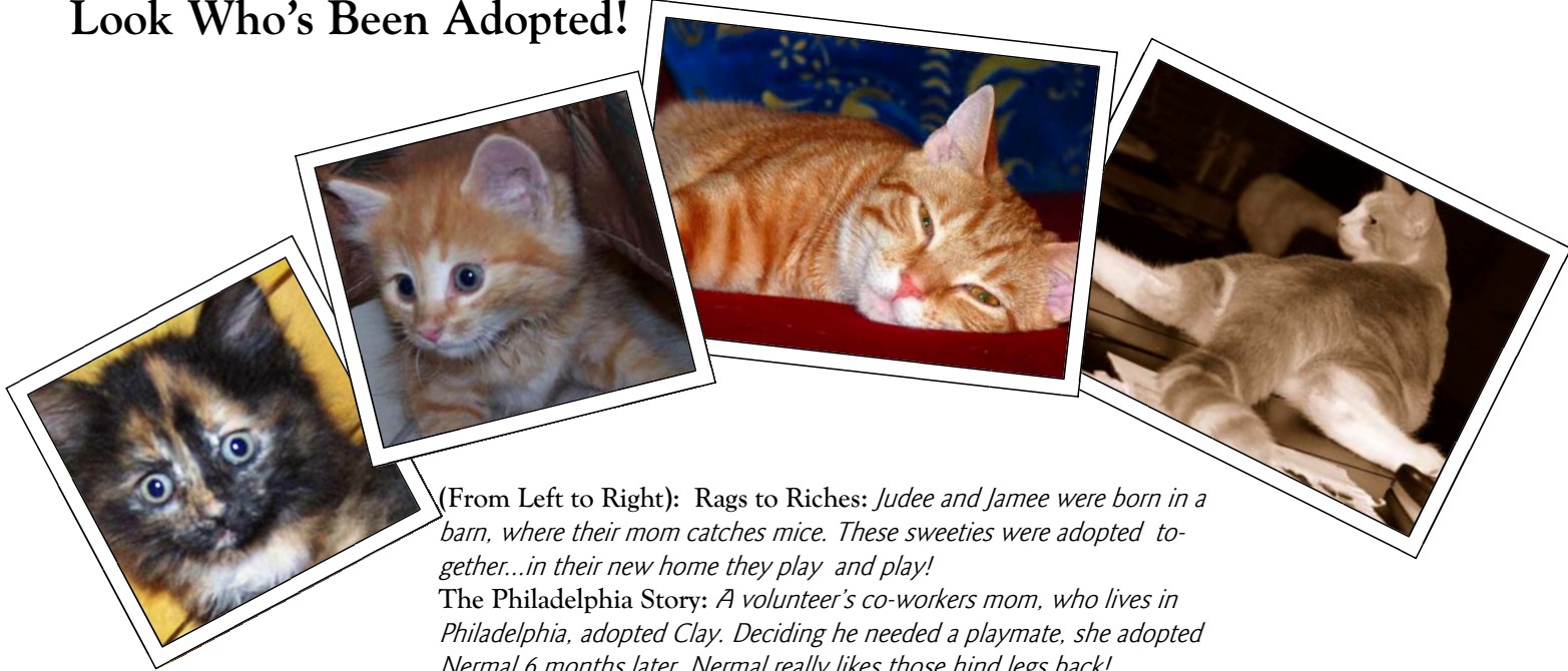
(From Left to Right): Rags to Riches: Judee and Jamee were born in a barn, where their mom catches mice. These sweeties were adopted together...in their new home they play and play! The Philadelphia Story: A volunteer's co-workers mom, who lives in Philadelphia, adopted Clay. Deciding he needed a playmate, she adopted Nermal 6 months later. Nermal really likes those hind legs back!