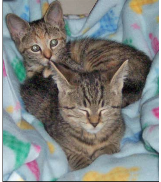
Soul looks out while PJ sneaks a peek from the back (left). Soul and Diva snuggle in a kitty carrier.