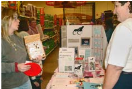
The recently opened Waynesboro PetSmart has led to several adoptions.

We have been taking cats to Northern Virginia on Fridays, Saturdays and Sundays for several years.